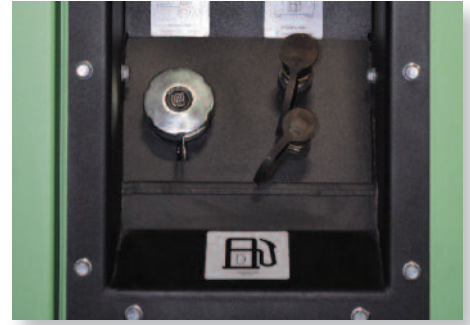
Remote Fuel Panel External fuel fill with remote fuel