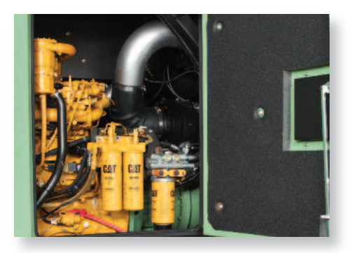
Total Accessibility Routine maintenance is simplified.