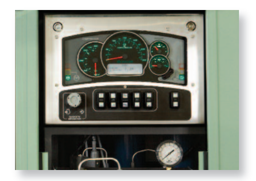
Instrument Panel Display Monitor gauges and LCD display.